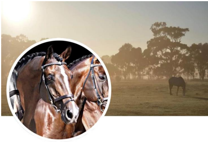
Isle of Wight Farm