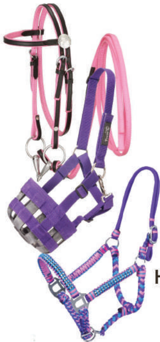
Halters & Bridles