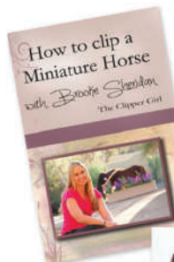
Books & DVDs

Australia's Largest Range of miniature horse & pony saddlery