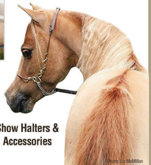
Show Halters & Accessories