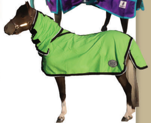
Full range of rugs