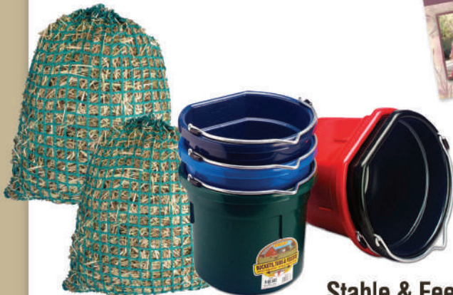
Stable & Feeding